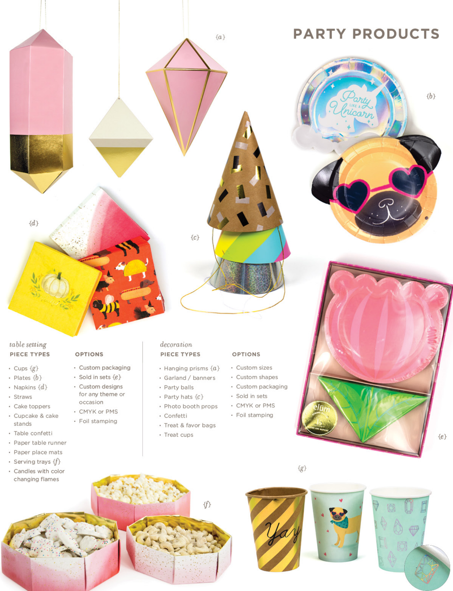
table setting PIECE TYPES