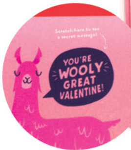
message under scratch-off